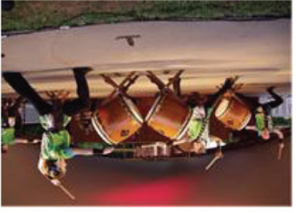
St. Louis Osuwa Taiko